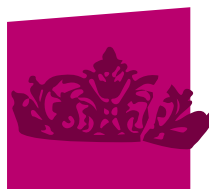
Andy Boss Thrust Stage

Friendship, love and painfully beautiful moments in this dance/theatre mash up set in the Bosnian War.