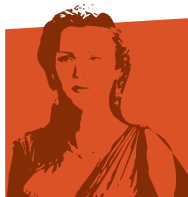
Andy Boss Thrust Stage

Fierce guitar playing and gospel music set the stage for the story of two women whose music laid the foundation for rock 'n' roll.