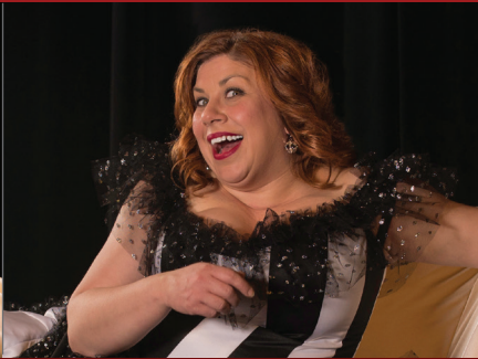
Judy! You Bette! Judy Garland and Bette Midler Classics April 22, 23

Be @ the Capri *** www.thecapritheater.org | TicketWorks 612 • 326 • 1813