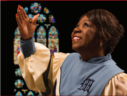
Sweeping Through the City: A Celebration of Gospel Music February 11, 12