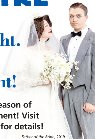
Father of the Bride , 2019

2020 will be PRT's 50th season of great summer entertainment! Visit www.sdstate.edu/PRT for details!